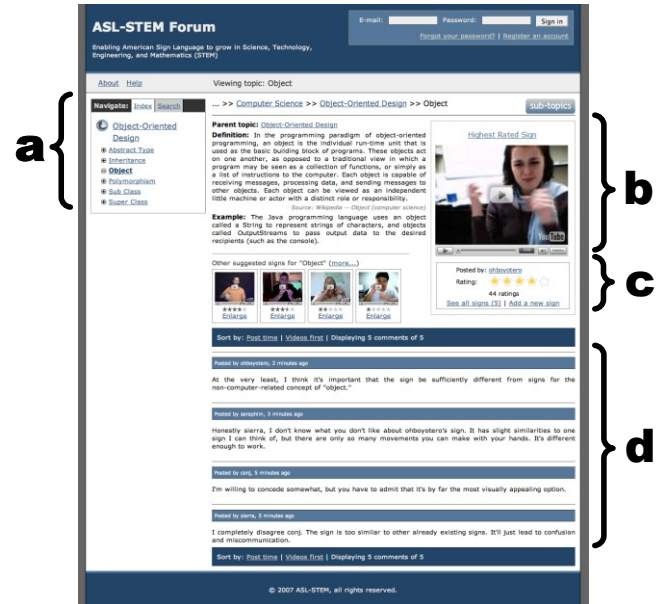
Figure 2: The ASL-STEM Forum page for the term “Object.” a) Terms are organized by the community into a meaningful hierarchy, b) the most highly ranked signs are displayed at the top, enabling the site to act as a reference, c) signs are rated by the community, and d) users can discuss each term in both English text and ASL video.

The next steps are to seed the ASL-STEM Forum with signs and promote it among potential participants. We will initially seed the ASL-STEM forum with signs targeted at introductory computer programming and data structures. To promote the ASL-STEM forum, we have organized an NSF-sponsored Summit to Create a Cyber-Community to Advance Deaf and Hard-of-Hearing Individuals in STEM (DHH Cyber-Community) to be held this summer at Rochester Institute of Technology. Participants at the summit will be able to participate fully on the site. We hope this will spawn discussion and feedback for the project and catalyze the forum's growth.